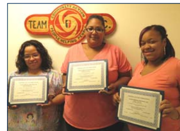
Proud GAIN graduates!

Taking a holistic approach, GAIN offers intensive case management to help clients break through the many barriers to employment they experience. Working with a case manager, clients develop and implement their own Individual Employability Action Plan, participate in peer support groups, attend weekly workshops, get connected with daycare and transportation services, receive job skill training, and, ultimately, gain employment in their chosen vocation.