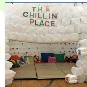
How cool is this igloo?